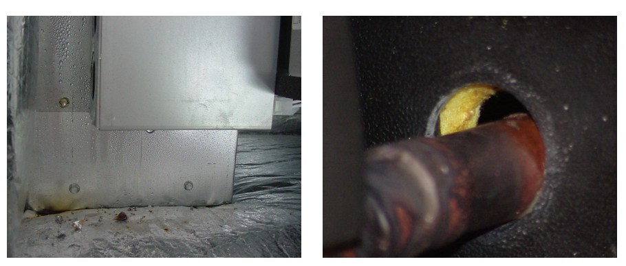
Figure 1: Condensation on metal electric panel inside air handler. Figure 2: Refrigerant line penetration into air handler without seal.

Additional duct testing was performed in 20 of the 69 systems. This extended testing included measuring the overall duct system airtightness and is discussed here to show a relationship between air-handler location and duct leakage to out. The duct system airtightness testing followed the duct airtightness test method of Standard 152-2004 obtaining both total leakage and