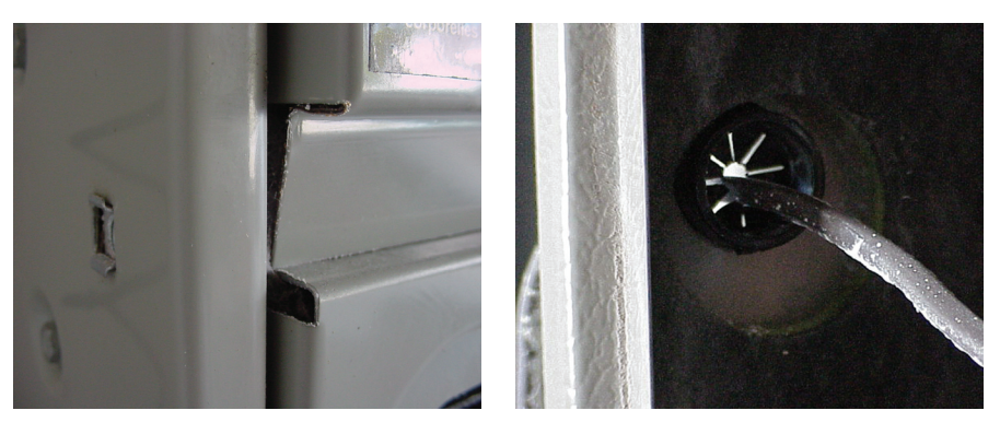
Figure 3 (Left): Example of panel leakage in electric heat AHU. Figure 4 (Right): Thermostat control wire penetration leak area.

prevent migration of contaminants to the adjoining occupiable space. Doors between garages and occupiable spaces shall be gasketed or made substantially airtight with weather stripping. HVAC systems that include air handlers or return ducts located in garages shall have total air leakage of no more than 6% of total fan flow when measured at 0.1 in. w.c. (25 Pa), using California Title 24 or equivalent." Of these two pathways, duct leakage would appear to represent a much greater contaminant transport risk.